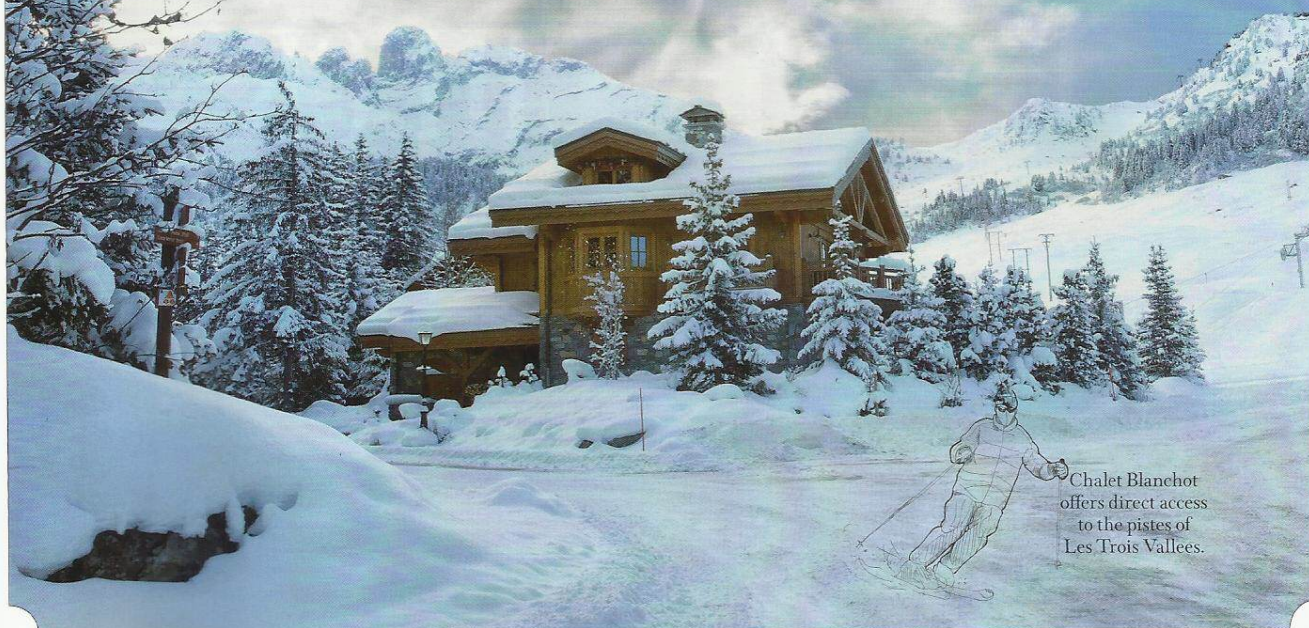
Chalet Blanchot offers direct access to the pistes of Les Trois Vallées.

the lights have gone out on the slopes, the Aman spa beckons. I spent my last evening cosseted in this pampering enclave, and fell into bed after dinner to drift into such a deep, restorative slumber, that I left the next morning so relaxed it seemed like I had spent the week on a spa retreat rather than an activity-packed ski vacation. Would I be coming back? Borrowing the words from my toddler: "Yes! But not so fast." ❄️