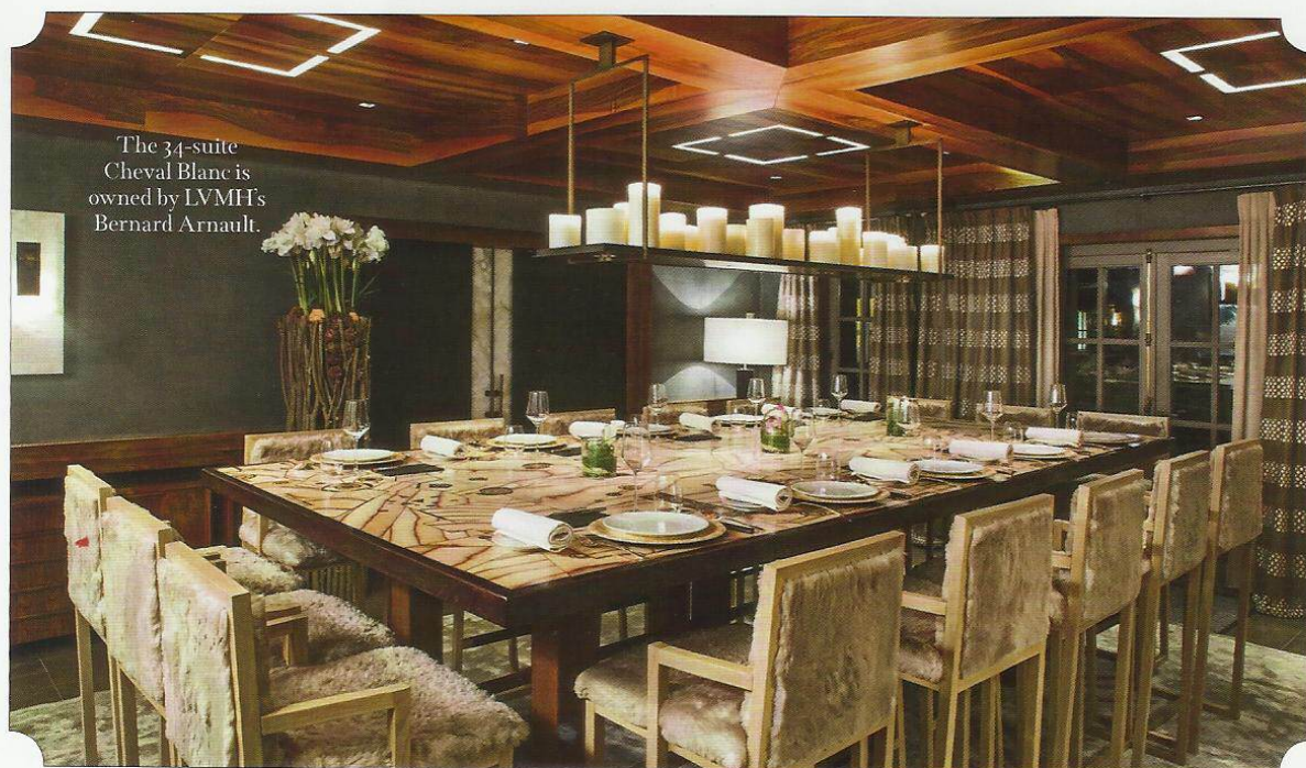
The 34-suite Cheval Blanc is owned by LVMH's Bernard Arnault.